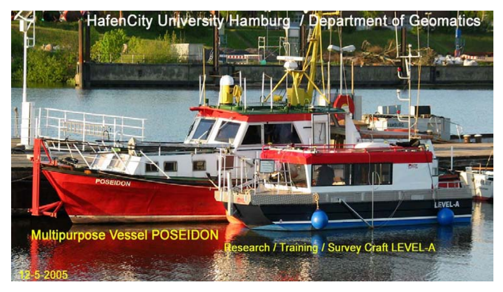
Figure 2: HCU survey craft for training, research and special purposes.

Models (DTM). To solve this problem, a new Integrated Multi-Sensor System IMSS will be used to measure heading, heave, roll, and pitch under all topographical conditions (e.g. passing huge container ships, running/surveying under bridges and in water-ways between rows of houses as found in the Hamburg Harbour).