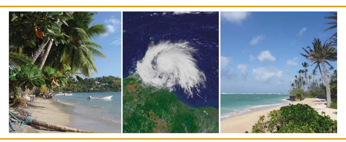
The Role of Land Professionals SIDS Seminar, FIG Congress, Sydney, Australia 14<sup>th</sup>–15<sup>th</sup> April 2010

Small Island Developing States and the Millennium Development Goals: Building the Capacity