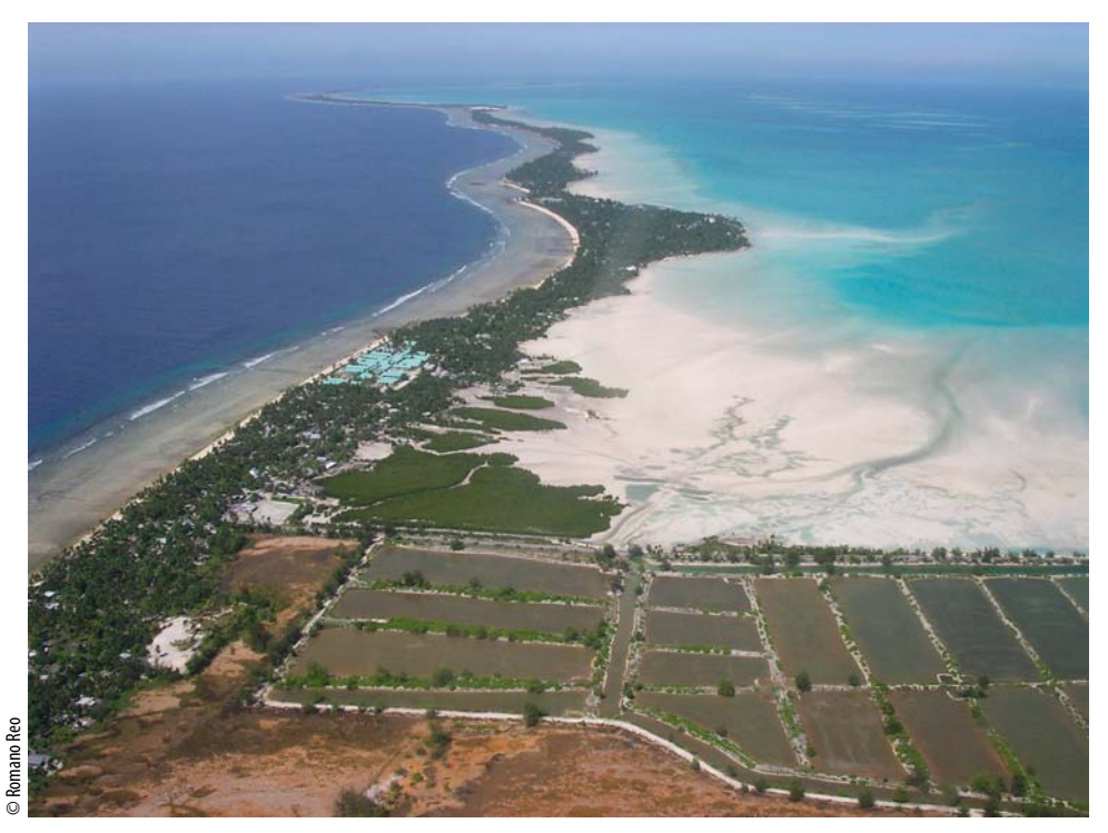
Low lying atoll, Kiribati

This publication is a result of the seminar on "Small Island Developing States and the Millennium Development Goals" held 14–15 April during the FIG International Congress in Sydney, Australia 11–16 April 2010. It includes a report of the seminar and an Agenda for Action as the main outcome of the seminar.