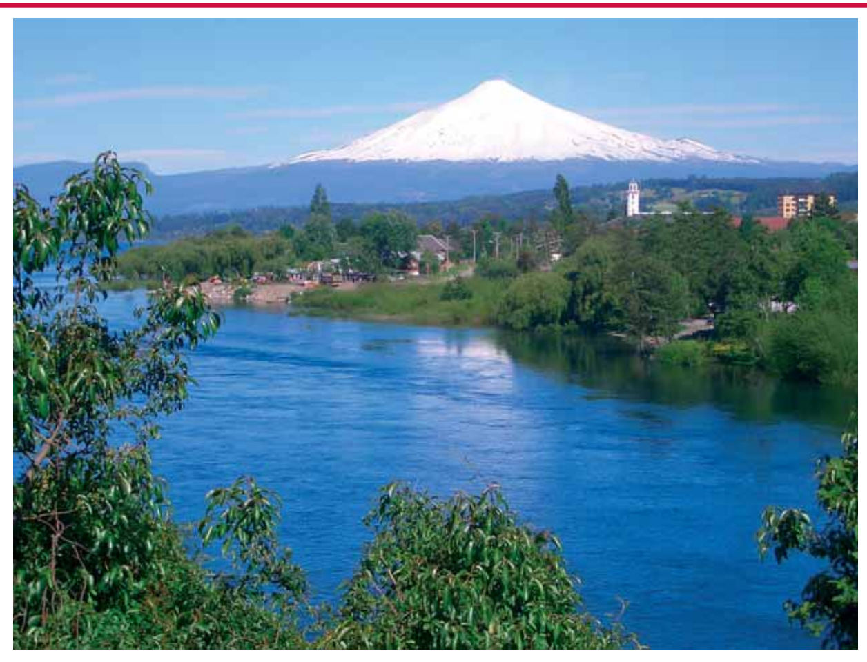
FIG PUBLICATION 41