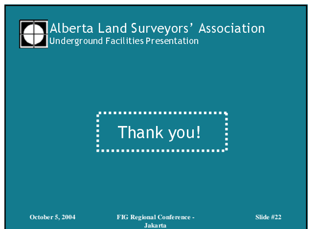
FIG Regional Conference -Jakarta