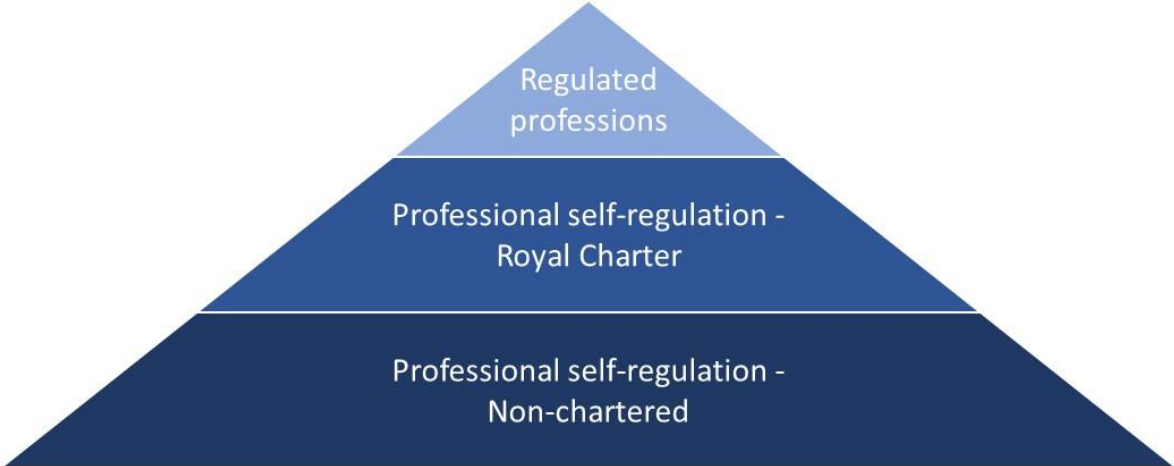
Figure 2: UK – 3-tier professional regulation system

In the UK, a 3-tier professional regulation system exists (Figure 2), which includes: (1) professions regulated by law, (2) professional self-regulation on the basis of the Royal Charter, and (3) professional self-regulation outside of the Royal Charter.