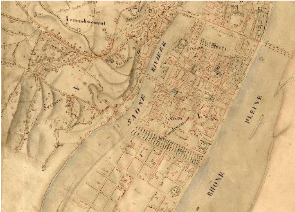
Exemple of the Cadastre Map of LYON (the second biggest French city in the center-east of France).