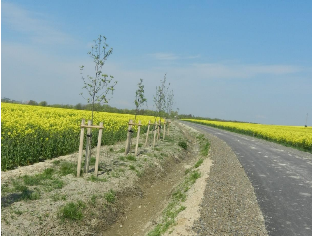
Fig. 3. Example of planting newly designed tree as part of post LC development in the village of Prusice in the Lower Silesian voivodship in Poland

In Poland, new opportunities for the introduction of NbS are provided by the Strategic Plan for the Common Agricultural Policy 2023-2027, which, under intervention I.10.8 "Land consolidation with post-consolidation development", provides project selection criteria concerning, in particular: