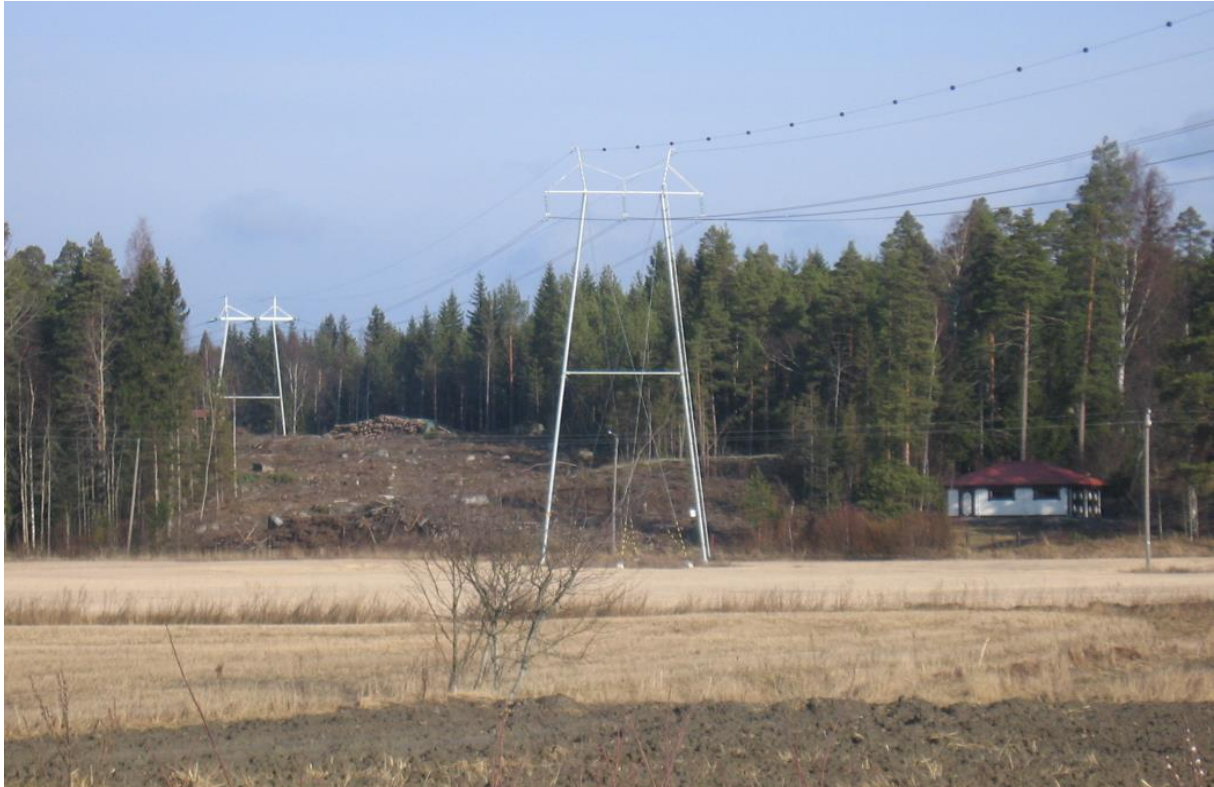
Figure 4. A new cable line outside of the city of Pori in Finland, was built during the expropriation procedure.

The compensation of the expropriated property is determined usually based on the sale prices of property. If this is not enough to cover the full losses during the expropriation, then the valuation is based on the profit that can be generated from the use of the property or the investment on the property.