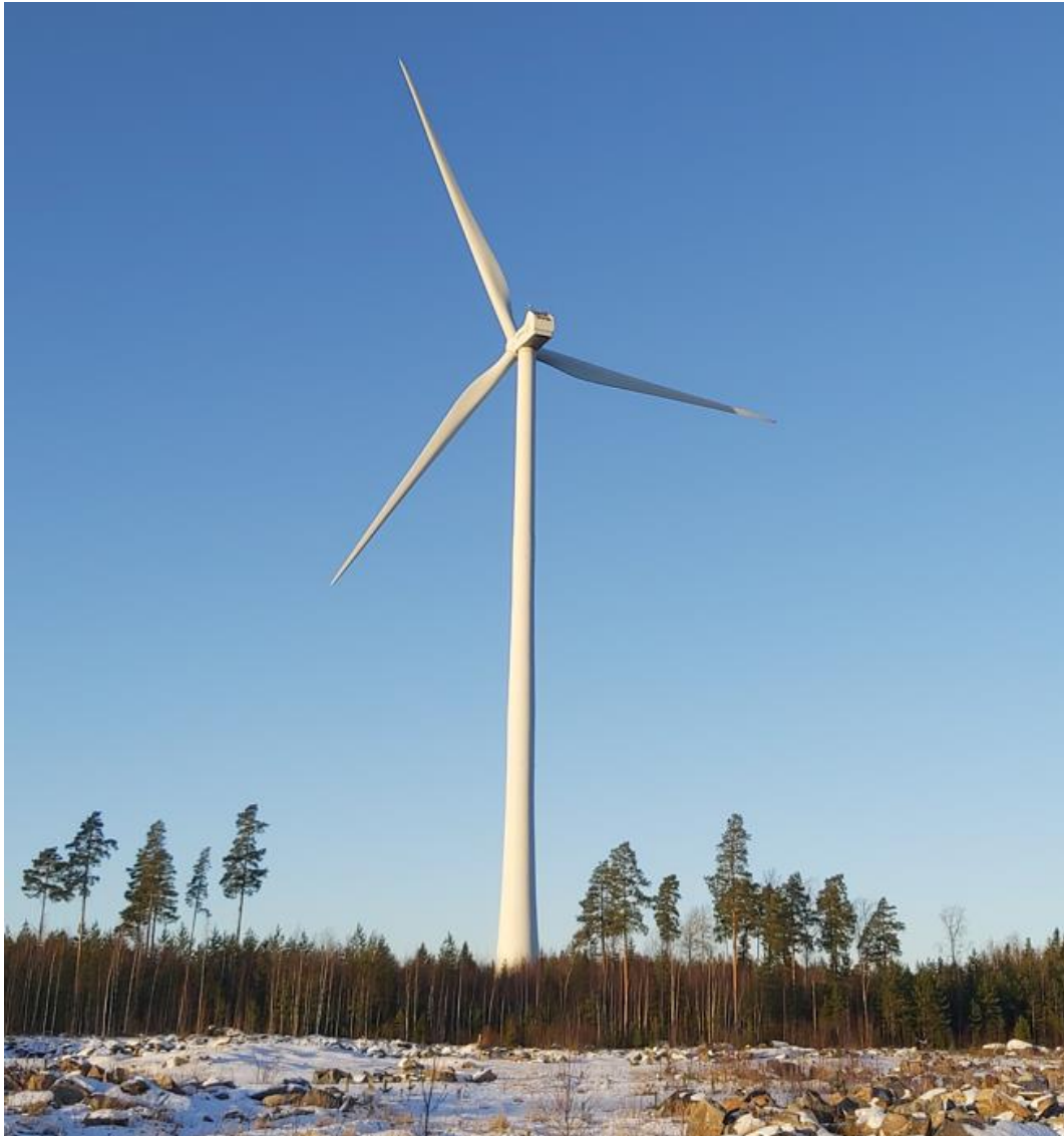
Figure 2. A windmill outside of the city of Pori.

Private landowners own over 60 % of the land area in Finland. The state of Finland owns about 30 % of the land area and the rest 10 % is owned by municipalities, churches, and companies. Most often wind power companies do not own the land under the windmills. So instead of buying the land, wind power companies lease the land from private landowners mostly through long-term contracts. Typically, this kind of leasing contracts can be valid for 30 years. For forest landowners, leasing of the land to wind power companies can be very profitable compared to what is generated from selling the wood from natural growth of the forest.