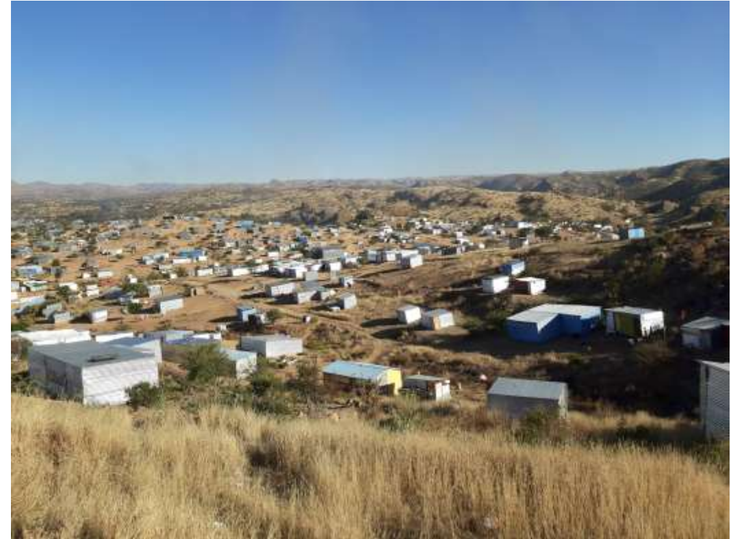
View of Informal Settlements on the periphery of Windhoek