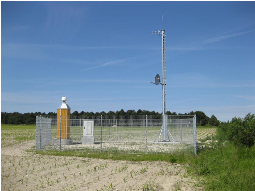
Figure 4. Permanent GNSS station on Lolland, Denmark.

The reference frame chosen is the ITRF2005 (Altamimi et al., 2007) which was the newest and most accurate realization of the ITRS at the time of definition of the reference frame. The four permanent GNSS stations described in the previous section form the local realization of the ITRF2005. This was achieved by using seven days of GNSS data from the four new stations along with data from six surrounding existing permanent GNSS stations of the network of the International GNSS Service, the IGS (Dow et al., 2009).