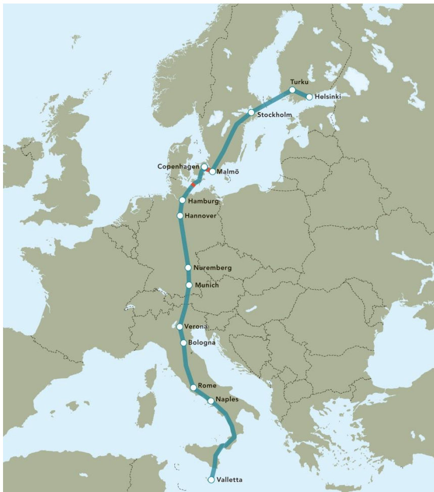
Figure 2. The Scandinavia-Mediterranean corridor. Location of the Fehmarnbelt Fixed Link is marked in red between Copenhagen and Hamburg. Illustration: Femern A/S.

With this paper we describe the solutions and implementations chosen, starting with the establishment of new permanent GNSS stations, selection of geodetic reference system, establishment of geodetic reference frame, definition of new height system, determination of a geoid model, derivation of parameters for coordinate transformations to national reference frames, definition of map projection, and last but not least the establishment of a GNSS RTK service for precise positioning within the construction area. First, however the construction project is introduced in the next section.