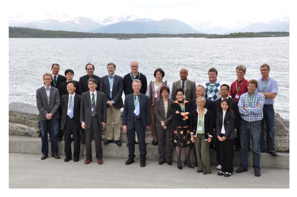
Figure 3. ISO 19152 Editorial Committee, Meeting in Molde, Norway, May 2009

During the development of the LADM many reviews have been performed resulting in new insights, improvements and proposals for extensions.