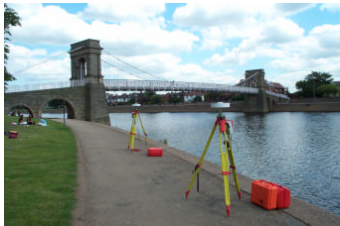
Figure 1. Wilford Bridge over the River Trent in Nottingham, UK

The Wilford Bridge is a suspension footbridge over the River Trent in Nottingham. Built at the beginning of the 20th century, the Wilford Bridge is a 69m long and 3.7m wide suspension footbridge (Figure 1). The bridge is held up by two sets of suspension cables restrained by two massive masonry anchorages and its steel deck is covered by a floor of wooden slats. It is about 2.8km away from the main campus of The University of Nottingham and was extensively utilised as a testbed for the abovementioned EPSRC project. The locations of GPS sensors were determined through an Effective Independence-Driving-Point Residue (EFI-DPR) technique developed by the project partner, Cranfield University. An initial analytical FE model was also created by Cranfield University using field measured structural dimensions since no detailed drawings are available for the bridge and this model is then gradually updated with field GPS and accelerometer measurements [12].