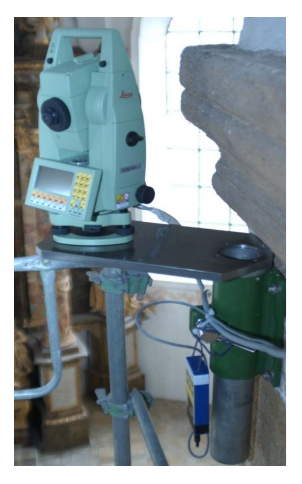
Fig. 1b: Total station with temperature sensor