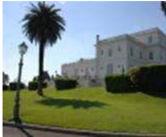
Villa Miani - the venue for the Gala Dinner.