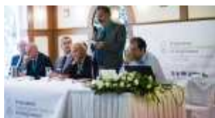
Training Course Opening

The 3rd International and Professional Training Course for Young Surveyors was an excellent and memorable event, organized and sponsored by the Consiglio Nazionale (the National Association of the Italian Surveyors) and Geoweb (the technical company which belongs to Consiglio and provides all information about the Italian Cadastre to the Italian surveyors),