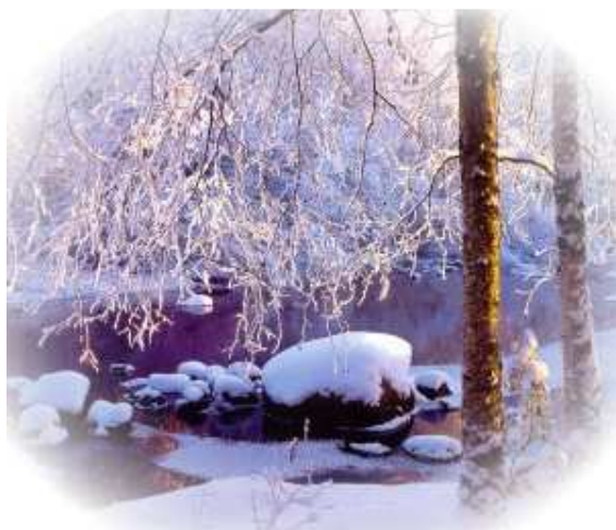
FIG Office wishes you:

Welcome to the FIG e-Newsletter, which brings you latest information about FIG and its activities. The information referred here is in full length available on the FIG web site. Thus the e-Newsletter is produced to inform you what has happened recently and what interesting things are going to take place in the near future. The FIG e-Newsletter is circulated monthly by e-mail. The referred articles are in English and written in a way that you are able to extract them to your national newsletters or circulate to your members and networks.