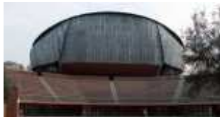
The impressive building "Parco della Musica" where the opening ceremony as well as concert will take place.