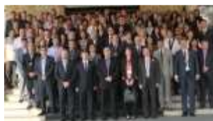
The participants at the conference