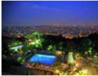
The wonderful panorama from the Rome Cavalieri - the conference venue of FIG Working Week 2012