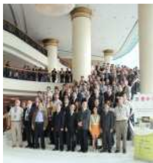
Participants at the international symposium

Structural failures such as collapses of bridges and buildings and geohazards caused by events such as landslides, ground subsidence and earthquakes are world-wide problems that often lead to significant economic and life losses. The symposium provided a forum for sharing latest research results, ideas and experiences in monitoring deformations of both natural phenomena and man-made structures. About 200 leading experts, researchers, industry practitioners and students from 27 countries and regions gathered for the Joint International Symposium on Deformation Monitoring (JISDM 2011). FIG was represented by Chair of Commission 6 Gethin Roberts.