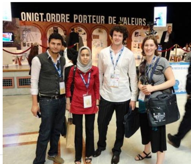
Young Surveyors 'surveying' the exhibition

A pre conference dinner shared with Singapore Land Authority's Senior Surveyor reinforced what young surveyors had told me. No amount of reading can compete with quizzing professionals on their recent projects, especially when they are so enthusiastic. An evening spent with Commission 4, 5 and 6 illustrated the less formal side of the conference. Sat at the Chair and Vice Chair's table, I enjoyed live music, fantastic cuisine, belly dancers and humorous conversation. The short walk to the restaurant took us across Djamaa El Fna, the market square. This cultural melting pot presented memorable experiences to share with new friends. Here snake charmers, storytellers, food vendors and musicians gather to entertain locals and tourists.