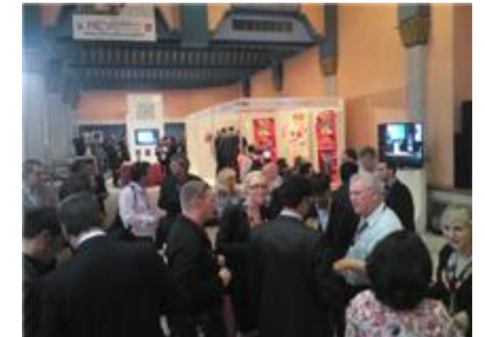
During a coffee break between the afternoon's technical sessions, conference goers gathered in the exhibition area where big and small names exhibited their latest survey equipment and software.

After an incredibly eye opening and rewarding week in Marrakech any reserves or stereotypes I had about international conferences were abolished, in fact, I now believe it is students and young professionals who have the most to gain. I returned home as a proud UK representative with a suitcase full of tagines, Djellabas, Berber leather bags and Moroccan spices, but more importantly as individual who had been enthused by the energy, passion and willing of those I'd met from all over the world, gathered for the same cause within the survey profession, “Bridging the Gap Between Cultures”.