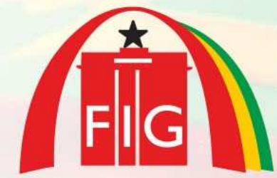
FIG Working Week 2024