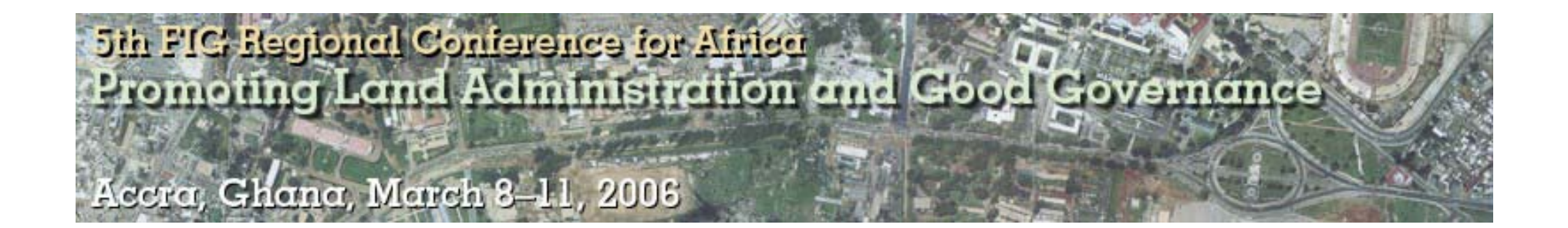
FIG is committed to Africa