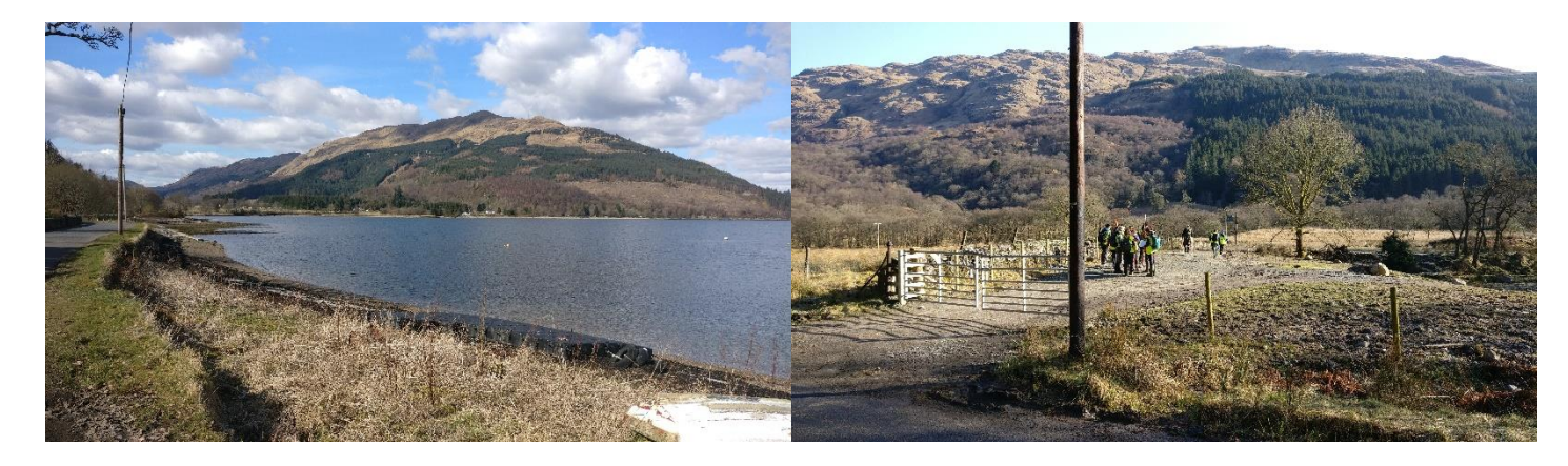
Figure 1 The usual field class location at Ardentinny

It is at the conclusion of semester 2, during the Easter break, that the surveying students have their 1-week residential land surveying field class in the west of Scotland – see Figure 2. Shortly after this, their second exam diet begins.