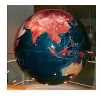
Many commissions are working with the United Nations and the World Bank on implementing the Millennium Development Goals.