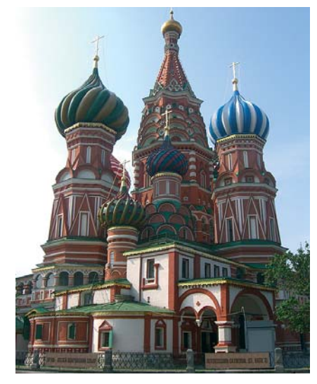
The Joint Board of GIS met in Moscow in August 2007.

The monument at Hammerfest, Norway, marking the northern end of the Struve Arc.