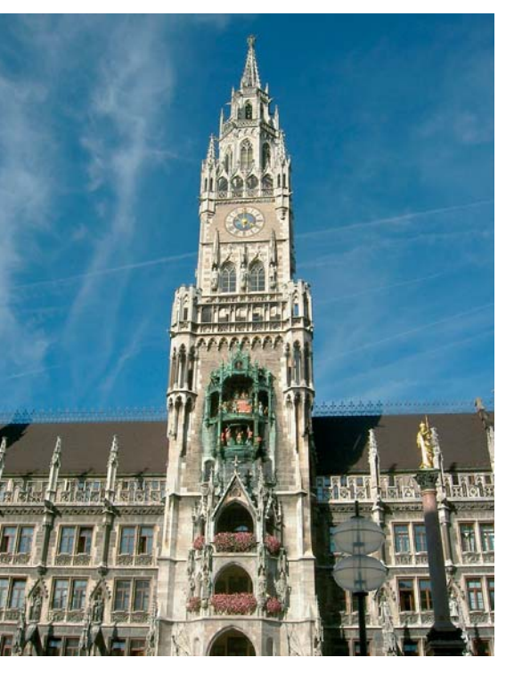
The City Hall of Munich at Marienplatz.