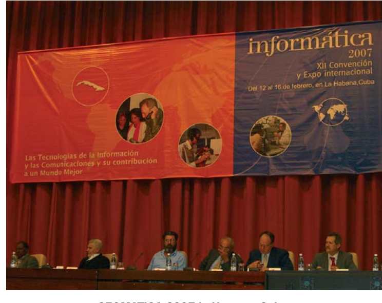
GEOMATICA 2007 in Havana, Cuba.