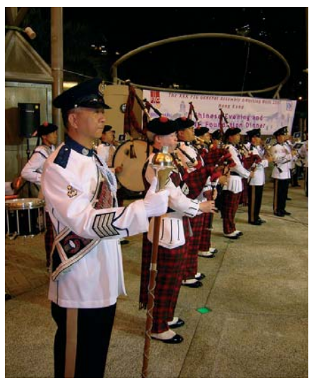
The Hong Kong Police Band entertaining participants at the FIG Foundation Dinner.

The second session of the General Assembly focussed on report of the next conferences.