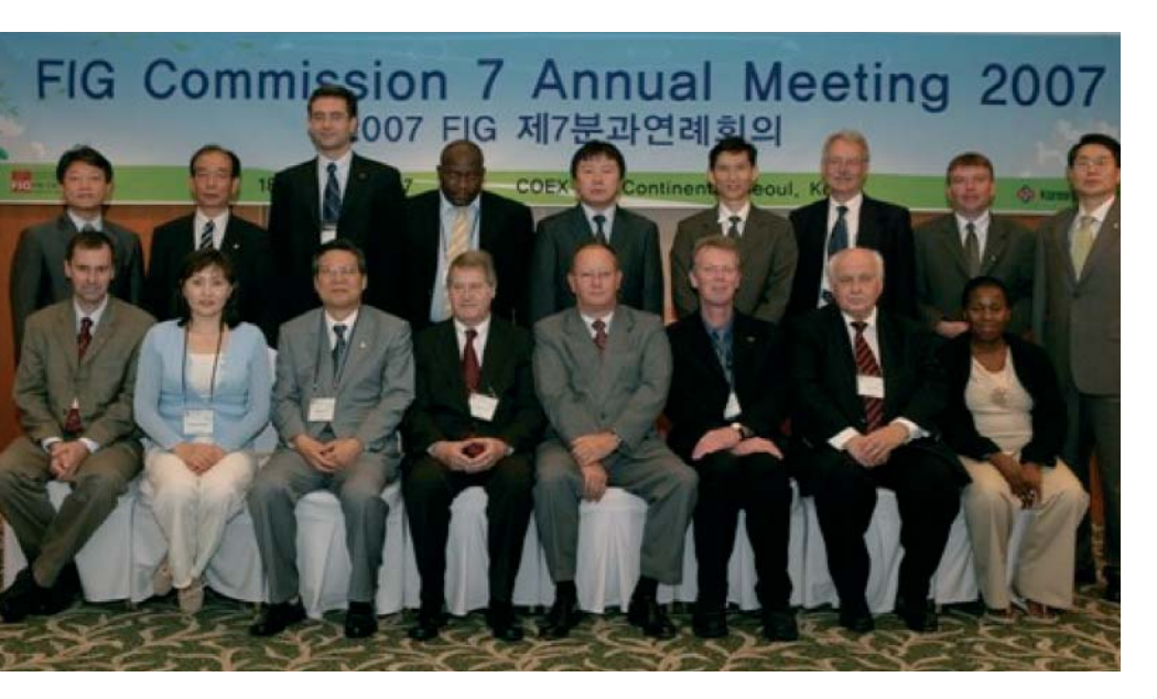
Participants at the Commission 7 Annual Meeting 2007 in Seoul, Korea.