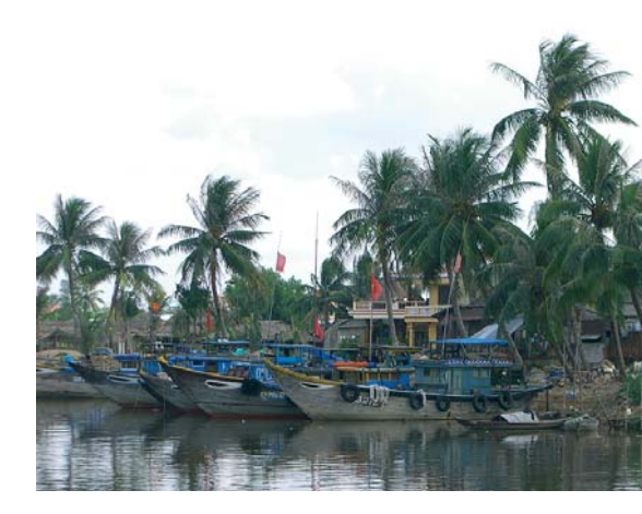
Commission 4 has a key role in planning coastal areas and on coastal zone management.