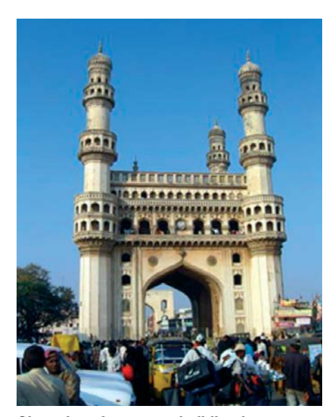
Charminar four tower building in Hyderabad, India where the World Map Forum took place.