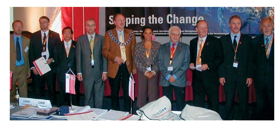
Commission Chairs receiving appreciation for their work as commission leaders at the end of the term of office.