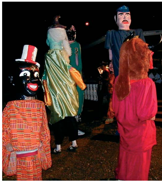
Costa Rican evening with mask dancers.

Based on the outcome of the conference, FIG is preparing a publication to identify problems and issues relating to coastal regions and analyse these in the context of integrated coastal zone management from the perspective of the role of the surveyor, supporting technology, capacity building and land administration. The publication will also examine recommendations and ways forward.