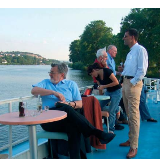
Sightseeing cruise on river VItava during Commission 2 symposium in Prague in June 2007.