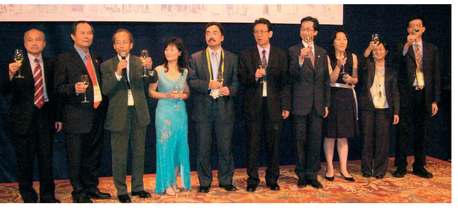
A toast to the Local Organising Committee at the gala dinner.