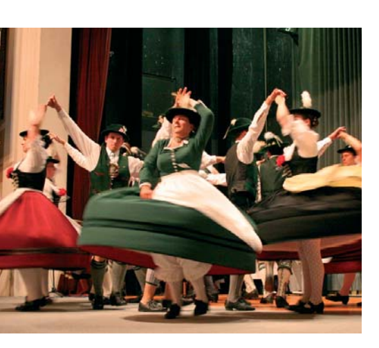
The combined INTERGEO-Treff and FIG Foundation Dinner attracted more than 1,800 participants to the sold out Löwenbräukeller to enjoy Bavarian culture, food and beer.

time. On Monday heads of national delegations were invited to lunch reception at the City Hall of Munich, hosted by the mayor of Munich. The reception allowed participants to admire this central point of Munich. The Bavarian State Reception was organised in the famous Kaisersaal of the Residenz Castle. These royal rooms gave an impression of the great history of Bavaria. Almost 700 guests crowded in these impressive rooms.